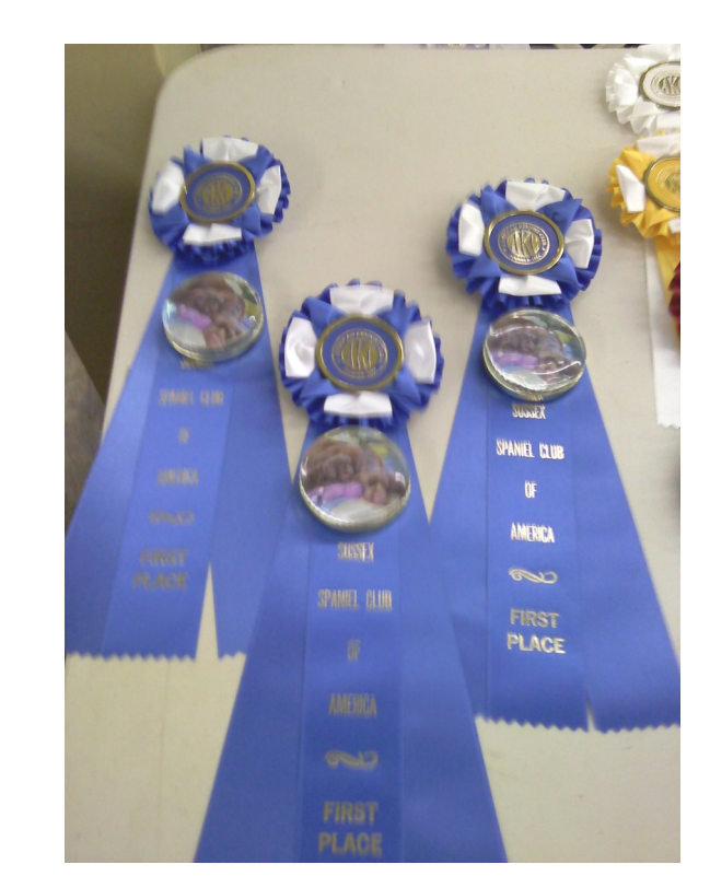
1st place in all Classes - Sussex paperweight