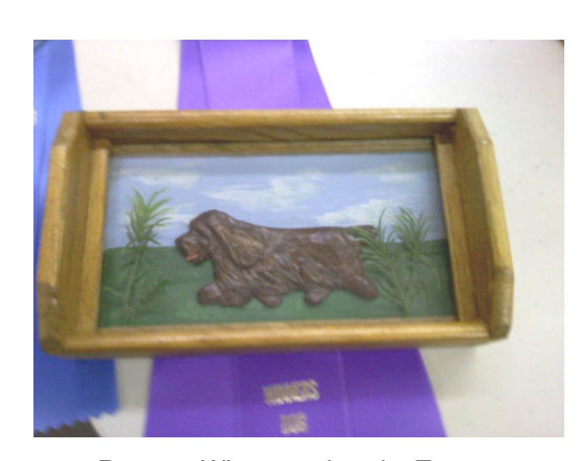
Reserve Winners - Jewelry Tray